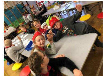
BL6 made Christmas hats and received candy canes from the church