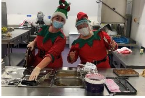
Christmas Dinner Day