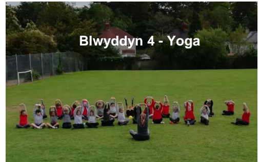
Blwyddyn 4 - Yoga