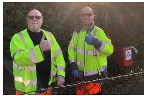
Council workers helping to keep the paths clean

Children are now managing to store their spare shoes in a designated year group only space so they can go out to play and then return to a dry pair of shoes. This life skill is an important example of them showing greater independence, tidying up after themselves, and keep their classrooms dry and safe.