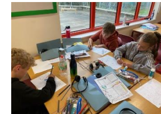
B6 Roald Dahl day, designing their own clothes