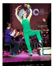
Bl5 attended the Welsh National Opera at Venue Cymru