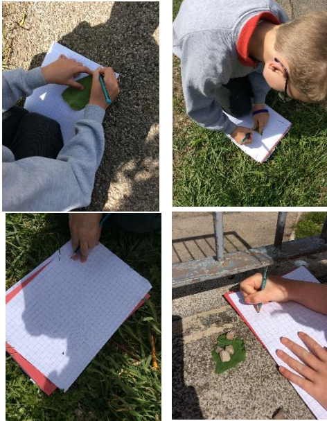
B5 – Finding the surface area of leaves