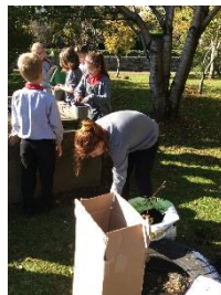
B5 planting their daffodil bulbs