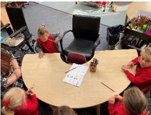
B6 Trip to Bryn Elan